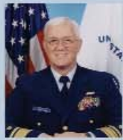
ADM PAUL PLUTA (USCG -RET)