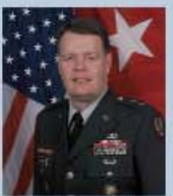
GEN DENNIS JACKSON (USARMY - RET)